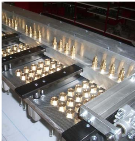
Tube changer for DDF pump rack with 6-powder pipes