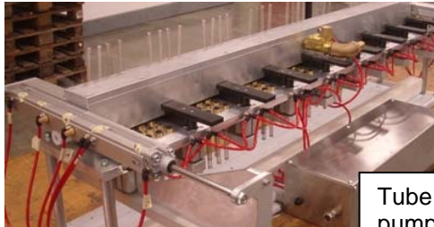
Tube changer for DDF pump rack